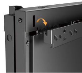
Easy to Install for a better user experience