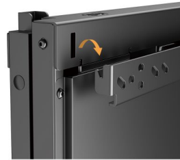
Easy to Install for a better user experience