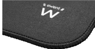
Suits Any Flat Surface slim and smooth

No Slipping Around 3mm Base Smooth Fabric Surface