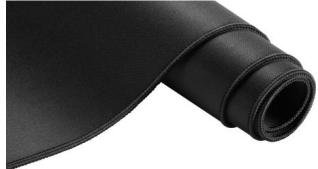
Washable Characteristic at a temperature up to 104 °F / 40 °C

Light-Weighted Design Foldable Appearance Machine Washable