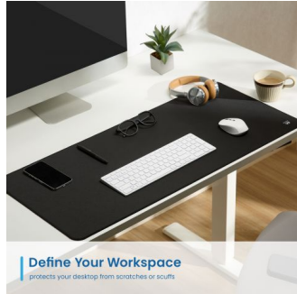
Define Your Workspace protects your desktop from scratches or scuffs