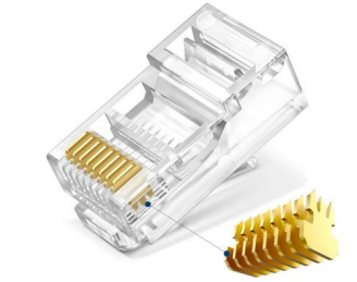
3 PRONG PINS GOLD PLATED 8P8C PINS ENSURE SECURE CONNECTIONS