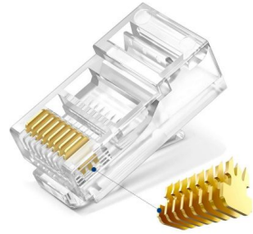
3 PRONG PINS GOLD PLATED 8P8C PINS ENSURE SECURE CONNECTIONS