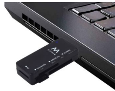
NO DRIVER NEEDED PLUG AND PLAY