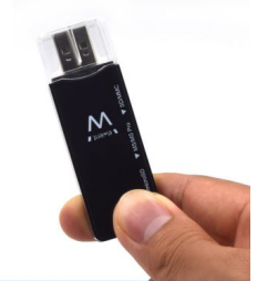
SMALL AND LIGHTWEIGHT