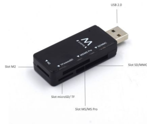
4 Card Slots