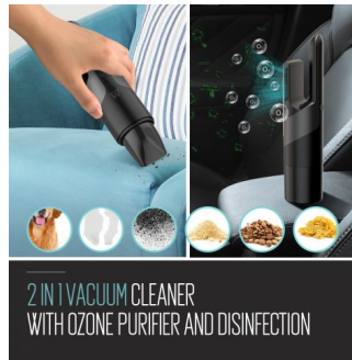
2 IN 1 VACUUM CLEANER WITH OZONE PURIFIER AND DISINFECTION