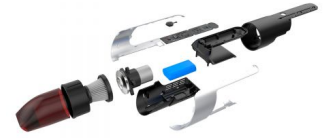
THE MOST INNOVATIVE SUCTION TECHNOLOGY