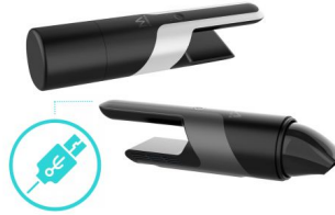
USB CHARGER FAST CHARGING TECHNOLOGY