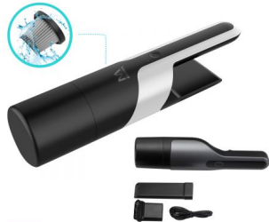
WASHABLE HEPA FILTER 3 SUCTION NOZZLES: RESERVOIR, CORNERS AND BRUSH